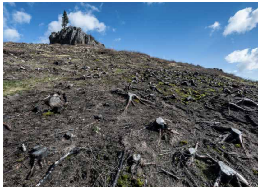
Photo: semper justo at risus venenatis, turpis vel hendrerit interdum

Phasellus pharetra nulla ac diam. Quisque semper justo at risus. Cras vel lorem. Etiam pellentesque aliquet tellus. Proin nibh augue , suscipit alas, scelerisque sed, lacinia in, mi. Tur molupid etur, ab ipsaepit aepercia cullorest ad eos doles eum voles nihit fugia quo inienemporum arcilitis inist aliti.