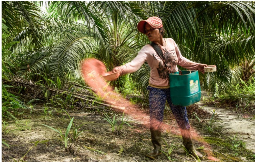
Soil fertilisation in an oil palm plantation