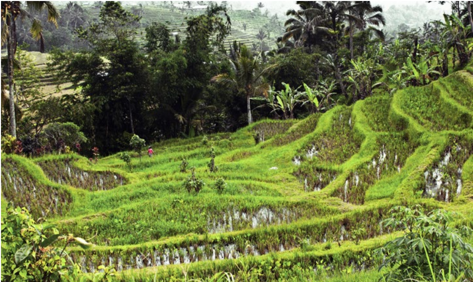
Rice plantation in Bali

Being able to track where progress towards sustainability has been happening at jurisdictional level is only part of the information needed to connect jurisdictions with responsible commodity buyers and investors. This information alone is of little use if market actors do not know where they source from, and if jurisdictions do not know where they sell. This is why Terpercaya is collaborating with the initiative Trase, Transparent supply chains for sustainable economies, which is developing a comprehensive tracking system for the palm oil sector in Indonesia. This system would be capable of tracking the supply chains connections that link individual palm oil-producing Indonesian districts to destination markets around the world. How the Terpercaya indicators and Trase data may be combined for useful analysis will be illustrated in a future briefing.