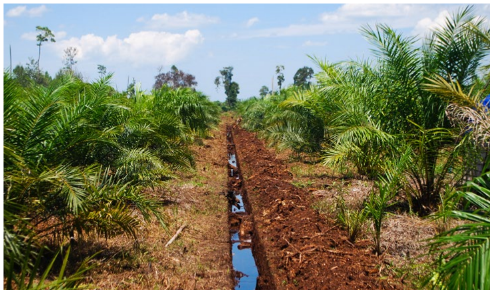
An oil palm plantation in Jambi

An in-depth review of relevant Indonesian laws and regulations, as well as of relevant SDGs was completed and is presented in Terpercaya Briefing 2. 3 This Briefing served as the basis to identify indicators that can best reflect the existing mandates and competences of local governments. 4 An initial round of stakeholder consultations was conducted between November 2018 and January 2019 to identify the most relevant indicators and come up with a shortlist for more in-depth discussions.